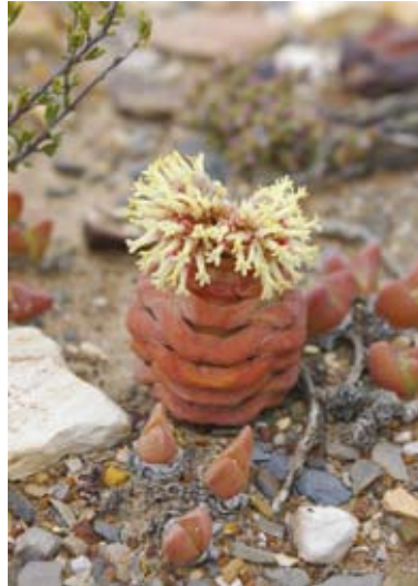
Front cover: Crassula columnaris surrounded by Gibbaeum gibbosum , north of Matjiesfontein in the Great Karoo.