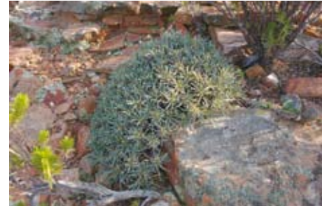
Back cover: Euphorbia multifolia south of Laingsburg, growing in association with Adromischus triflorus and Pteronia fastigiata at the habitat of the rare Haworthia marxii .