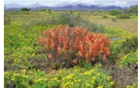
Back cover: Aloe variegata at De Rust in the Klein Karoo.