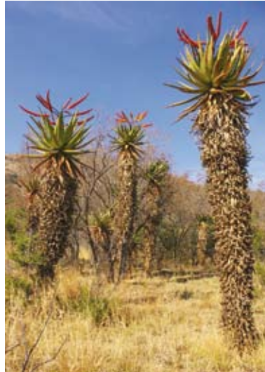
Front cover: Aloe marlothii near Utrecht.

Designed by: Homestead Graphic Art Studio. Printed by: Business Print Centre.