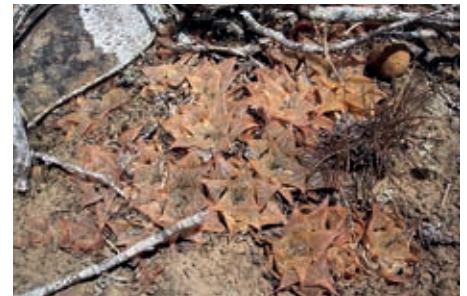
Back Cover: Haworthia acuminata , growing a few kilometres inland from the Gouritz River Mouth.