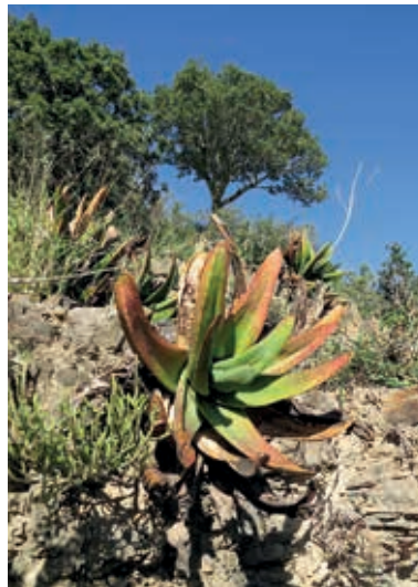
Front Cover: Gasteria excelsa , one of the largest species in the genus. Here growing close to the Great Fish River, south west of Peddie in the Eastern Cape Province.

Designed by: Homestead Graphic Art Studio. Printed by: Business Print Centre.